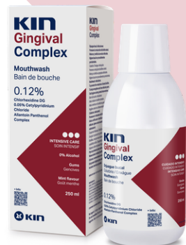
KIN GINGIVAL COMPLEX Mouthwash 250 ml